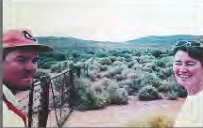
Mervin Cloete (Poelshoek Development Forum) and Hilda Ibsen (AdminAfrica project) at the fence between a commercial farm and the common land of Poelshoek, Lelofontein in the Northern Cape of South Africa. Green pastures on the commercial side, dry burnt pastures on the poelshoek side.

ANC land reform started on a good footing with the RDP, but has since moved to a policy of supporting entrepreneurial emerging middle-class black farmers rather than the immiserated rural subsistence farmers. This has shifted government funding and support towards the urban areas leaving rural areas destitute.