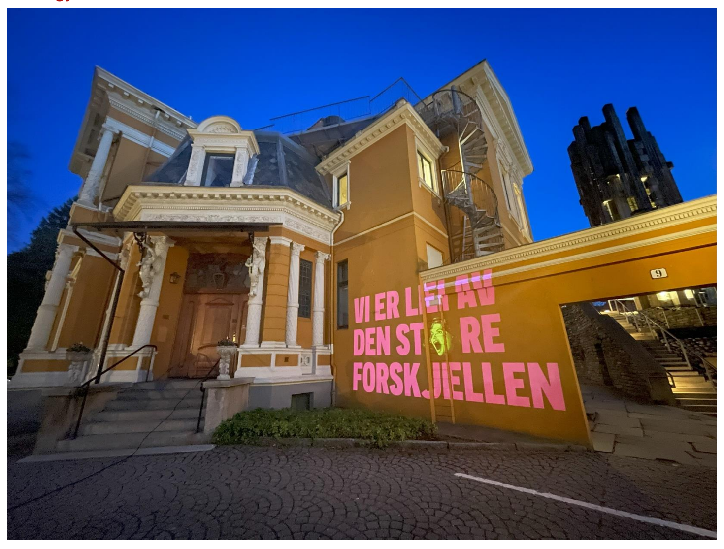
Strategy 2023–2030: Centre for Women's and Gender Research (SKOK), UiB

Projection activism at Parkveien 9.