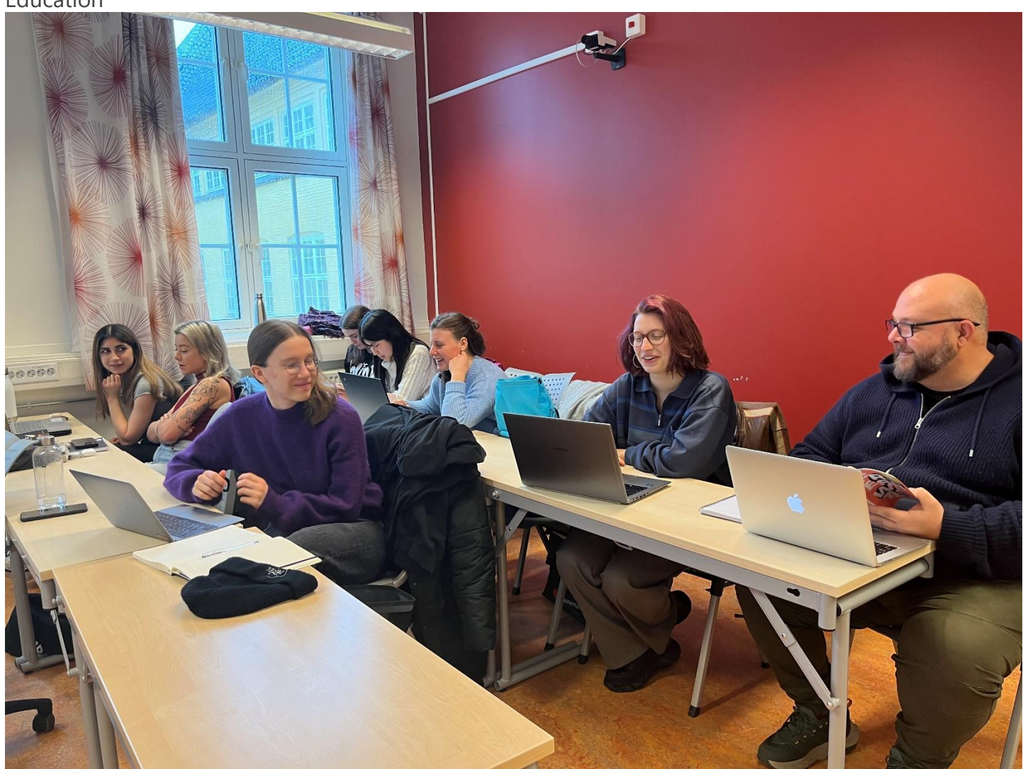
Students in action in the gender studies course KVIK206.